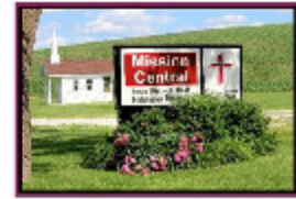
40218 Highway E-16 Maclester, Iowa 51234 Website www.missioncentral.us

Dear NOT NORMAL Co-workers for the Lord Jesus: