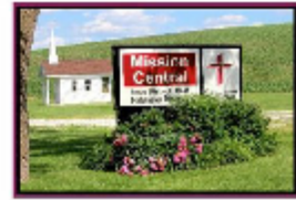
40218 Highway E-16 Maclester, Iowa 51234 Website www.missioncentral.us