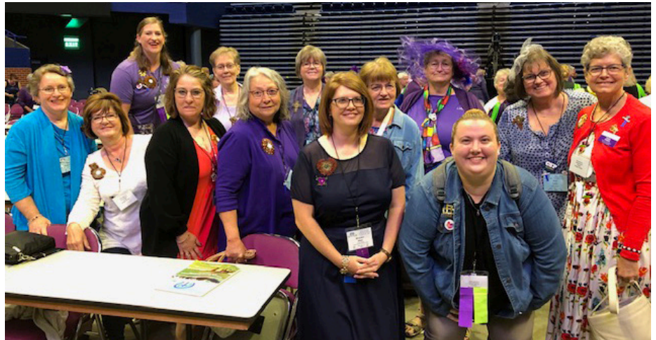
Members of the South Dakota District LWML were elated to be gathered with their sisters (and brothers) in Christ at the national convention in Lexington, Ky.

join our LWML sisters from around the country. God worked through this year-and-a-half of uncertainty and the national convention had 2,787 people in attendance.