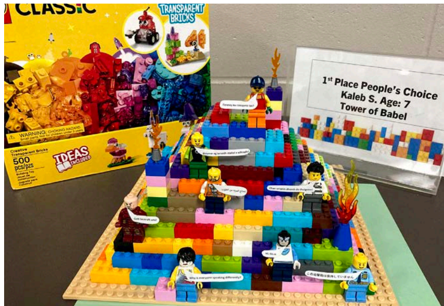
A design of the Tower of Babel won first place at the first LEGO challenge at Memorial, Sioux Falls.

Memorial Lutheran Church, Sioux Falls, held a LEGO Bible challenge in February. Folks could pick a Bible story and then build it out of LEGOs to share! On Feb. 28th, the creations were displayed. Attendees voted for their three favorite creations. A Thrivent Action Team grant was secured to purchase prizes of LEGOs. It will become an annual tradition at Memorial.