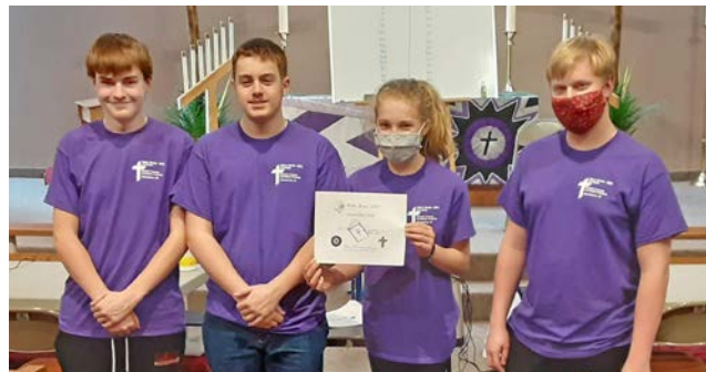
Pictured is the team from Mount Calvary, Brookings.

It was a job well done by all the teams and individuals competing on short notice this year. May God bless His Word among them for eternal life.