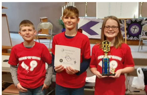
Pictured is the middle school team from Concordia, Cresbard.