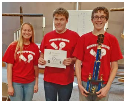
Pictured is the high school team from Concordia, Cresbard.