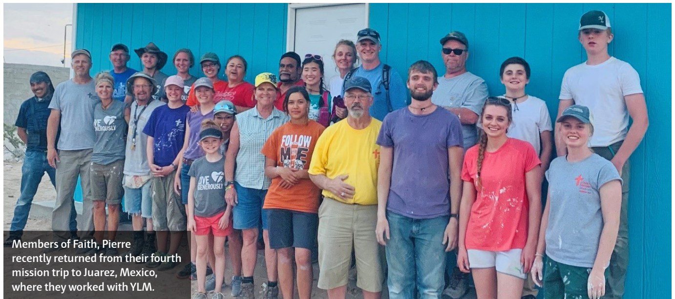
Members of Faith, Pierre recently returned from their fourth mission trip to Juarez, Mexico, where they worked with YLM.

Steamboat Park Amphitheater Poplar Avenue, Pierre