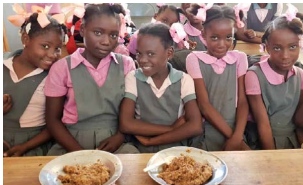
Providing meals for Haitian children is one of 11 mission grants for the LWML South Dakota District.