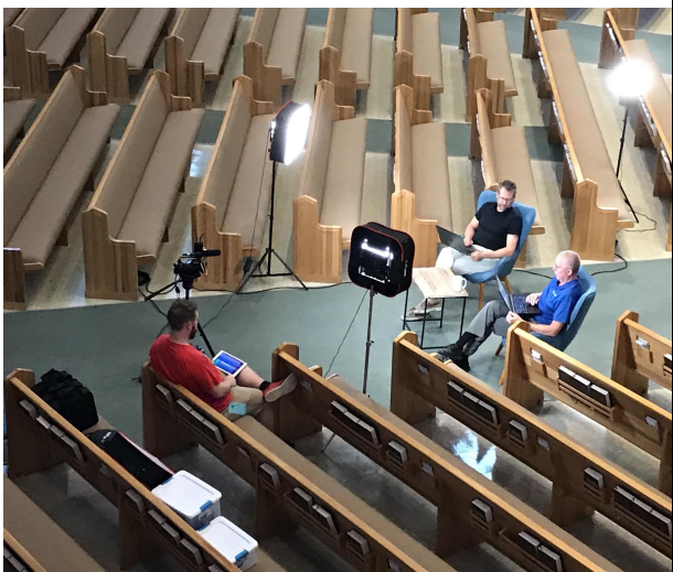
Live with Pastors